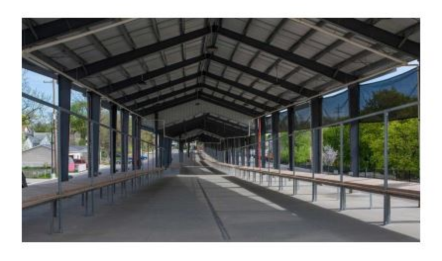
In closing, we feel this is a great opportunity to create an excellent partnership that would bring a very unique and creative feature to downtown Smithville.